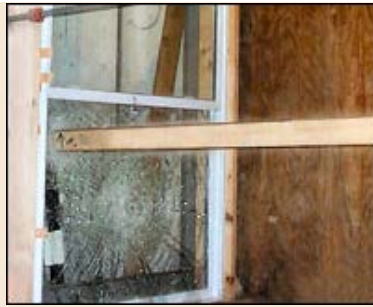
Actual Missile Impact Test

The tough laminated glass shatters, but the special urethane glazing holds it firmly in the frame, even after being repeatedly subjected to hurricane force wind pressure.