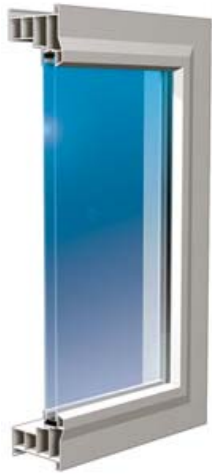
Nuweld II Picture Window